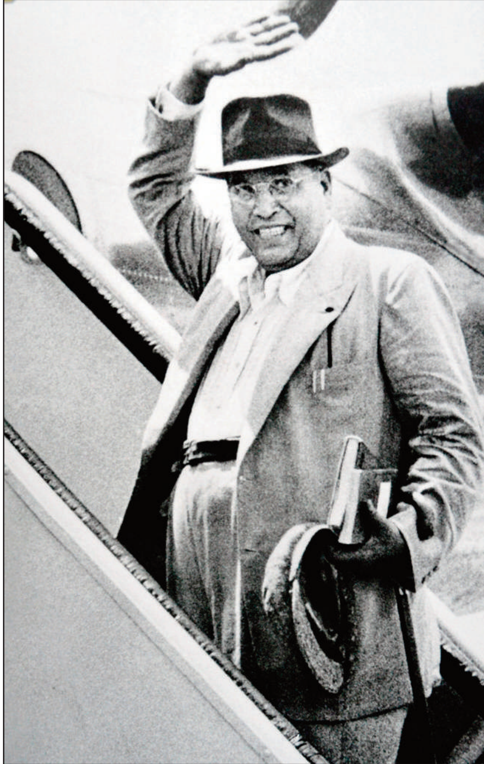
April 2020, followed by a declaration that 14 April is „Dr B.R. Ambedkar Day of Equality“. This was followed by the Province of British Columbia,

Dr Ambedkar's contribution to social equality is as significant as that of Dr Martin Luther King Jr and Dr Nelson Mandela. It is a matter of great pride for all Indians to observe when a number of organisations, institutions and local authorities in India, and around the world are honouring Dr Ambedkar by declaring 14 April, a day of equality. First City of Burnaby in Canada proclaimed this in